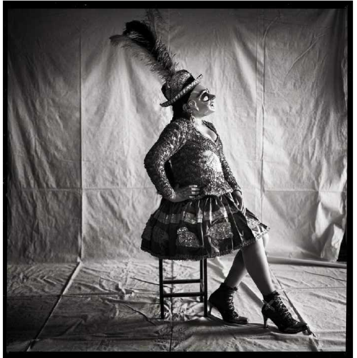
El sueño de la China